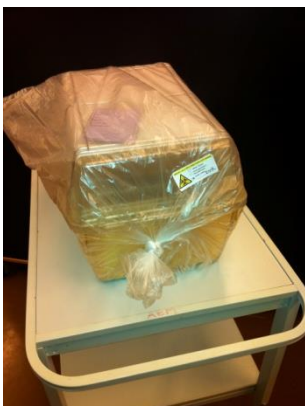
Figure 2. Wrapping, cage card with relevant info, labeling and placed on a trolley.