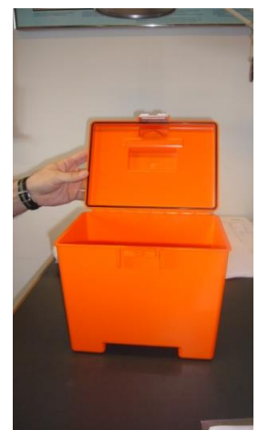
Figure 3-4. Box for transporting GMO class 2 microorganisms.